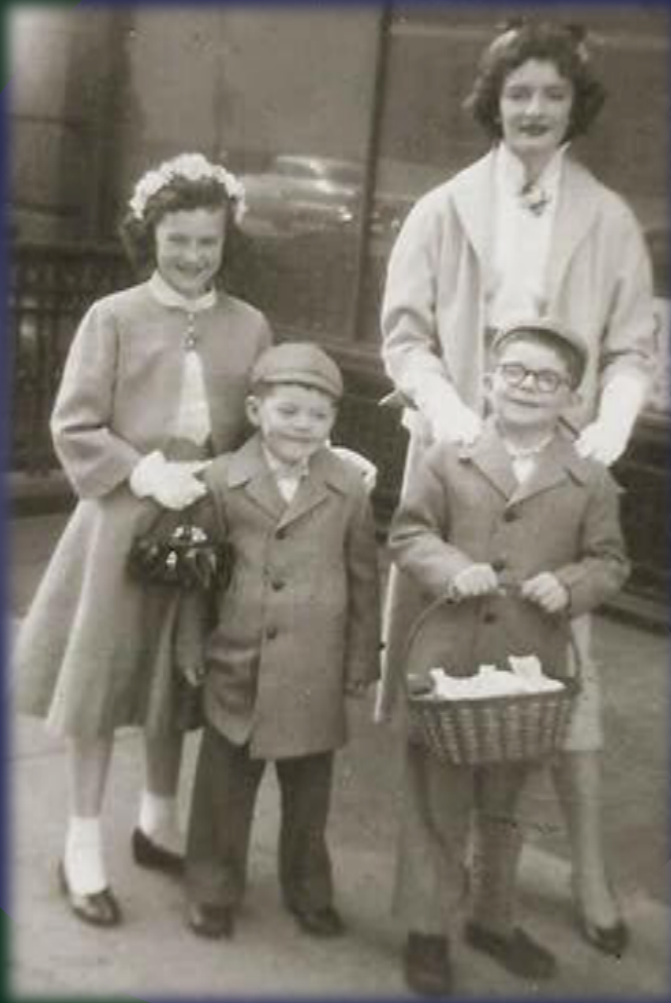
Easter Sunday 1955 With Brother & Cousins