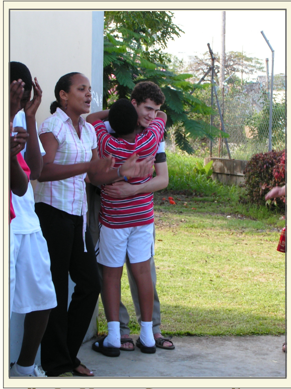
LE MOYNE COLLEGE

The Dominica Service-Learning Project began in 2002. Since that time six groups of students and faculty have been spending ten days in the Commonwealth of Dominica doing volunteer service and theological reflection upon our experiences. The program aims at honing students' talents to promote a more just society.